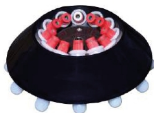
Angle Head 12x20ml