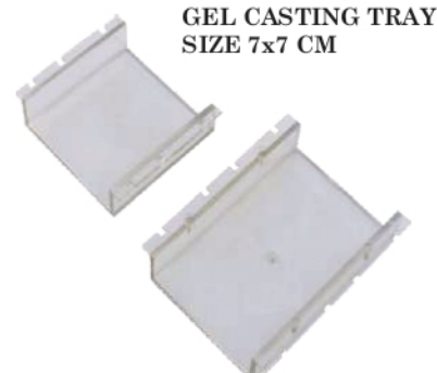
GEL CASTING TRAY SIZE 7x7 CM